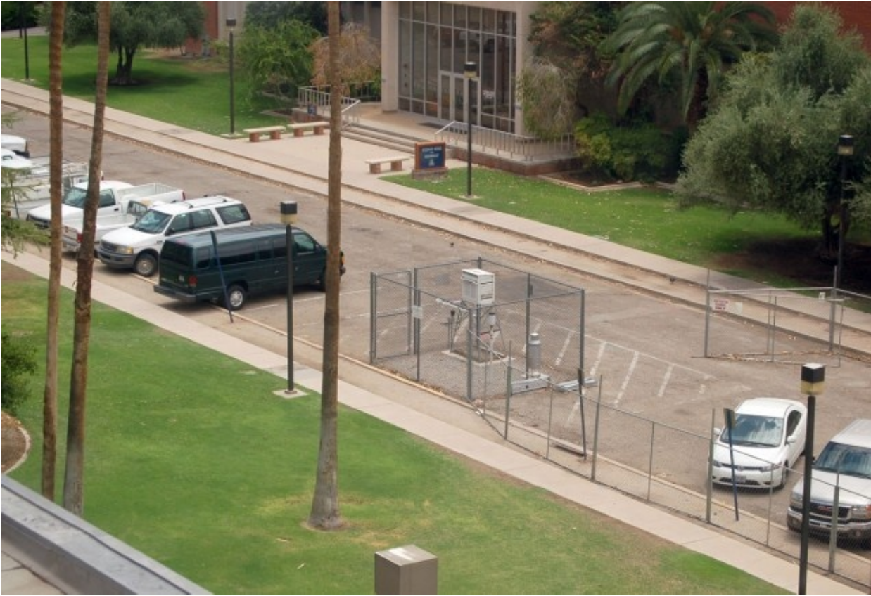
Figure caption: USHCN station #028815 at the University of Arizona, Tucson. Note the placement in the parking lot.